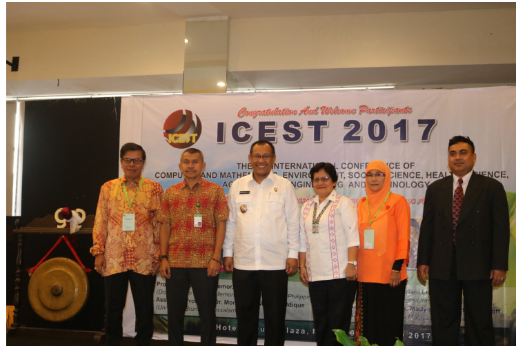
The Keynote Speakers with the members of the Organizing Committee